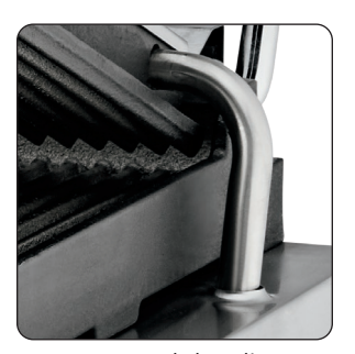
Improved, leveling hinge systems