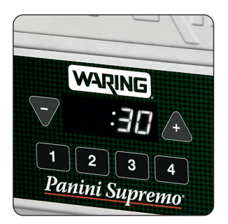
Digital timer with 4 programmable time settings