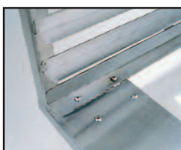
High strength heliarc welded ledges.