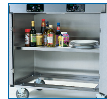
Interior Storage Shelf