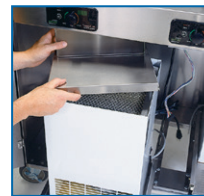
Optional Filtration Unit