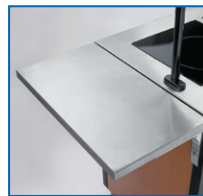
Optional Fold-Down Shelf