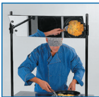
Optional Demo Mirror