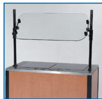
Optional Breath Guard