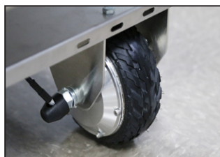
Integrated Hub Motor Wheels