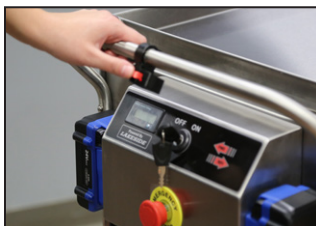
Speed/Direction Thumb Control