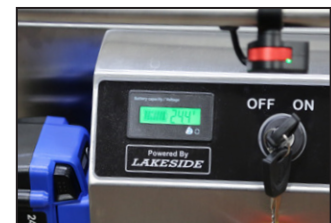
Battery Level Meter