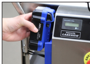
Hot Swappable Batteries