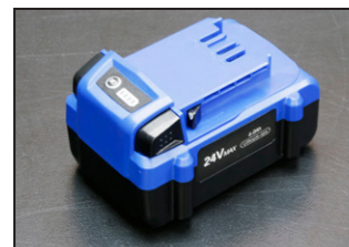
24V Lithium-Ion Batteries