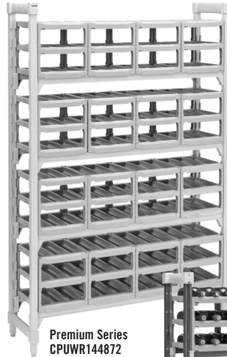
Premium Series CPUWR144872