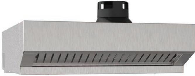
XAKHT-HCHS: Half Size Ventless System for Cadco Bakerlux LED/TOUCH Convection Ovens