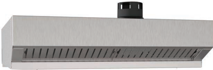
XAKHT-HCFS: Full Size Ventless System for Cadco Bakerlux LED/TOUCH Convection Ovens

UL evaluated under the KNLZ category "Commercial Cooking Appliances with Integral Systems For Limiting the Emission Of Greaseladen Air". Using EPA test method 202 emissions of grease laden vapor were measured at 0.24 mg/m 3 . Results are less than the established 5 mg/m 3 . Please allow 4 inches of clearance in the back and 2 inches of clearance on the side for proper airflow to maximize the performance and to prevent any issues or damages to the product.