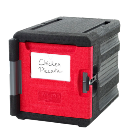
ML300 4 Pan Front-loader